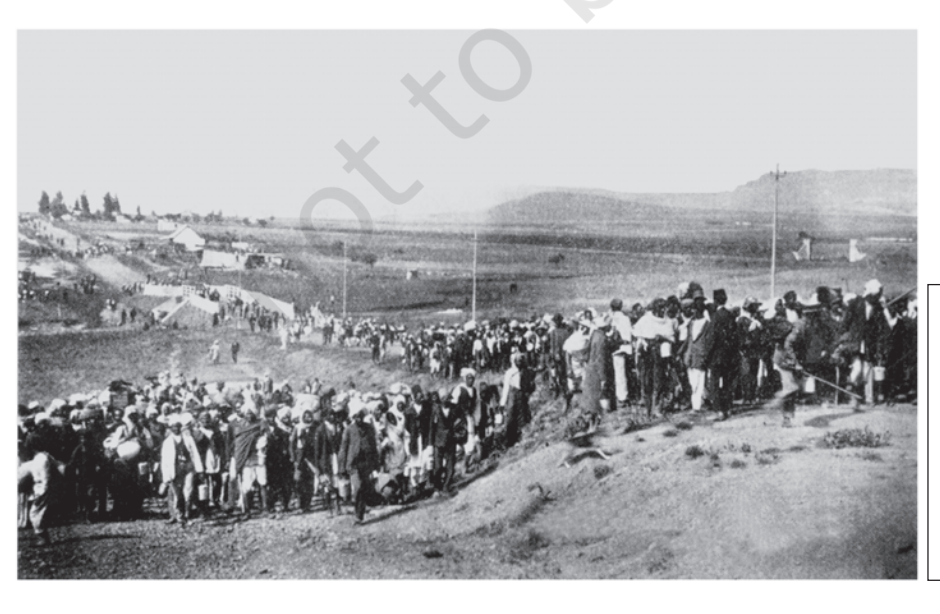
Fig. 2 – Indian workers in South Africa march through Volksrust, 6 November 1913.

Forced recruitment – A process by which the colonial state forced people to join the army