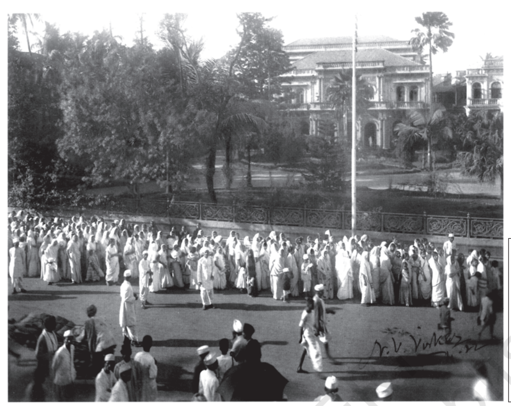
Fig. 9 – Women join nationalist processions. During the national movement, many women, for the first time in their lives, moved out of their homes on to a public arena. Amongst the marchers you can see many old women, and mothers with children in their arms.

picketed foreign cloth and liquor shops. Many went to jail. In urban areas these women were from high-caste families; in rural areas they came from rich peasant households. Moved by Gandhiji's call, they began to see service to the nation as a sacred duty of women. Yet, this increased public role did not necessarily mean any radical change in the way the position of women was visualised. Gandhiji was convinced that it was the duty of women to look after home and hearth, be good mothers and good wives. And for a long time the Congress was reluctant to allow women to hold any position of authority within the organisation. It was keen only on their symbolic presence.