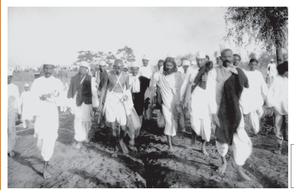
Fig. 7 – The Dandi march. During the salt march Mahatma Gandhi was accompanied by 78 volunteers. On the way they were joined by thousands.

with the British, as they had done in 1921-22, but also to break colonial laws. Thousands in different parts of the country broke the salt law, manufactured salt and demonstrated in front of government salt factories. As the movement spread, foreign cloth was boycotted, and liquor shops were picketed. Peasants refused to pay revenue and chaukidari taxes, village officials resigned, and in many places forest people violated forest laws—going into Reserved Forests to collect wood and graze cattle.