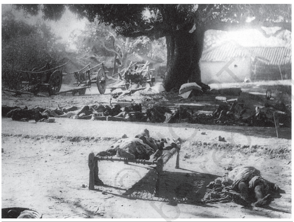
Fig. 5 – Chauri Chaura, 1922. At Chauri Chaura in Gorakhpur, a peaceful demonstration in a bazaar turned into a violent clash with the police. Hearing of the incident, Mahatma Gandhi called a halt to the Non-Cooperation Movement.

The visions of these movements were not defined by the Congress programme. They interpreted the term swaraj in their own ways, imagining it to be a time when all suffering and all troubles would be over. Yet, when the tribals chanted Gandhiji's name and raised slogans demanding 'Swatantra Bharat', they were also emotionally relating to an all-India agitation. When they acted in the name of Mahatma Gandhi, or linked their movement to that of the Congress, they were identifying with a movement which went beyond the limits of their immediate locality.