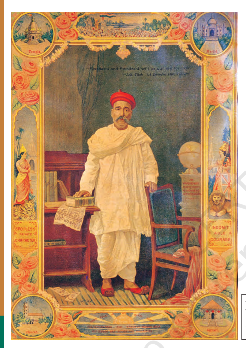
Fig. 11 – Bal Gangadhar Tilak, an early-twentieth-century print. Notice how Tilak is surrounded by symbols of unity. The sacred institutions of different faiths (temple, church, masjid) frame the central figure.

Nationalism spreads when people begin to believe that they are all part of the same nation, when they discover some unity that binds them together. But how did the nation become a reality in the minds of people? How did people belonging to different communities, regions or language groups develop a sense of collective belonging?