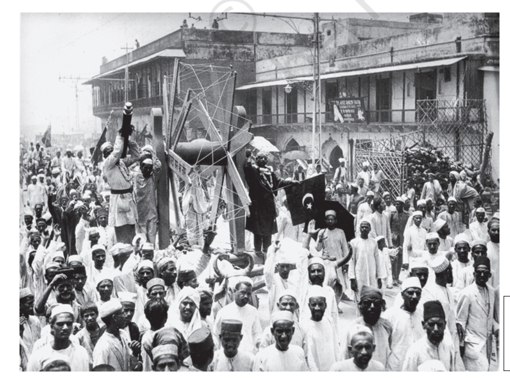
Fig. 4 – The boycott of foreign cloth, July 1922. Foreign cloth was seen as the symbol of Western economic and cultural domination.

Boycott – The refusal to deal and associate with people, or participate in activities, or buy and use things; usually a form of protest