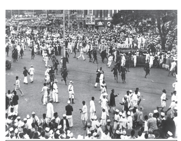
Fig. 8 – Police cracked down on satyagrahis, 1930.

In such a situation, Mahatma Gandhi once again decided to call off the movement and entered into a pact with Irwin on 5 March 1931. By this Gandhi-Irwin Pact, Gandhiji consented to participate in a Round Table Conference (the Congress had boycotted the first