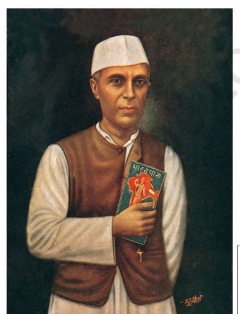
Fig. 12 – Bharat Mata, Abanindranath Tagore, 1905.

Ideas of nationalism also developed through a movement to revive Indian folklore. In late-nineteenth-century India, nationalists began recording folk tales sung by bards and they toured villages to gather folk songs and legends. These tales, they believed, gave a true picture of traditional culture that had been corrupted and damaged by outside forces. It was essential to preserve this folk tradition in order to discover one's national identity and restore a sense of pride in one's past. In Bengal, Rabindranath Tagore himself began collecting ballads, nursery rhymes and myths, and led the movement for folk