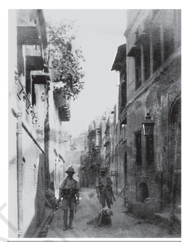
Fig. 3 – General Dyer's 'crawling orders' being administered by British soldiers, Amritsar, Puniab. 1919.

In his famous book Hind Swaraj (1909) Mahatma Gandhi declared that British rule was established in India with the cooperation of