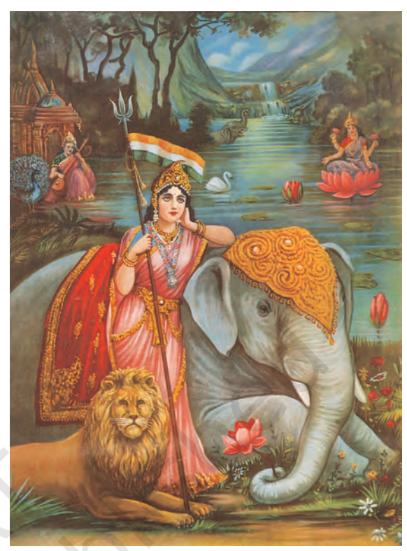
Fig. 14a – Bharat Mata. This figure of Bharat Mata is a contrast to the one painted by Abanindranath Tagore. Here she is shown with a trishul, standing beside a lion and an elephant – both symbols of power and authority.

These efforts to unify people were not without problems. When the past being glorified was Hindu, when the images celebrated were drawn from Hindu iconography, then people of other communities felt left out.